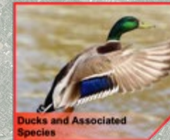
Ducks and Associated Species