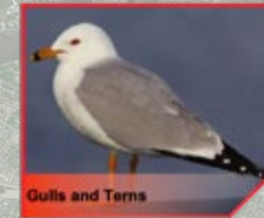
Gulls and Terns