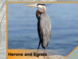
Herons and Egrets