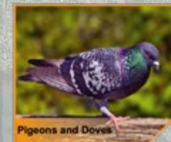
Pigeons and Doves