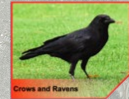
Crows and Ravens